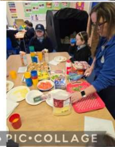
PIC • COLLAGE