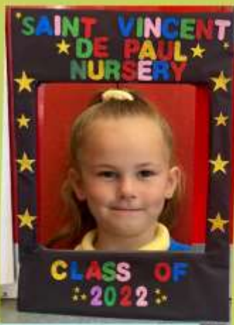
Our 2022 Nursery Graduates 🎓