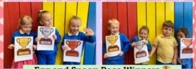
Egg and Spoon Race Winners 🏆