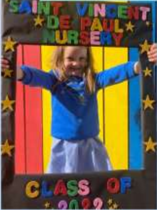
Our 2022 Nursery Graduates 🎓