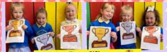
Sprint Race Winners 🏆