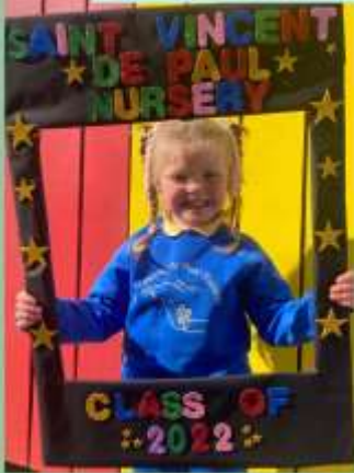
Our 2022 Nursery Graduates 🎓