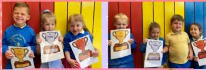
Javelin Throwing Winners 🏆